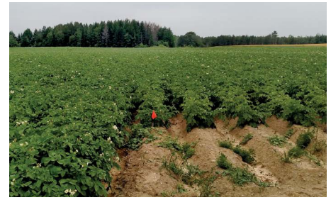
NANO CAL increased the specific gravity and periderm calcium in 100% of 2018 Maine trials.

"I have never seen this happen before with a calcium product" was Noel's response to these key results. In addition to these direct effects Noel ran some pro-forma financial results that really turned